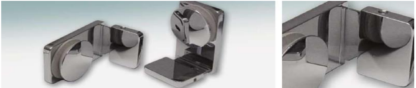
Bracket glass / wall 90° inside (screw system)